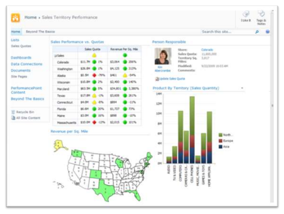
Figure 4 - PerformancePoint Services in Microsoft SharePoint Server 2010

Dashboard filters can be applied across the dashboard components, enabling users to update multiple or all parts of a dashboard simultaneously. With cube-based graphs and charts, users can perform ad-hoc analysis, slice and dice dimensional data, navigate through hierarchies, and pivot and change chart types quickly and seamlessly in just a few clicks. This type of analysis enables users to interact with the data and gives them the ability to arrive at answers that may not be available at first glance. PerformancePoint Services dashboards can incorporate data from a variety of sources, providing the capability to develop and manage the presentation of reports through one tool. In addition, report and dashboard development can be performed much faster through use of the structured layout and predefined design options available in PerformancePoint Services.