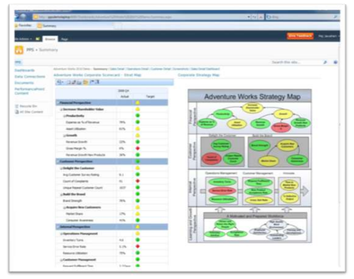
Figure 5 - Scorecarding with PerformancePoint Services in Microsoft SharePoint Server 2010

Balanced and free-form scorecards, along with strategy maps, enable organizations to provide a concise vehicle for communicating overall company performance and comparing that performance to well-defined targets. A major benefit of scorecards is the ability to aggregate and display disparate data into unified and summarized scores.