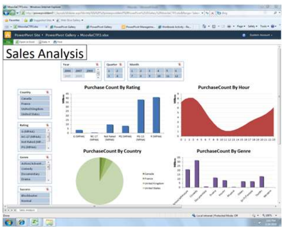
Figure 2 - PowerPivot Model Published to SharePoint Server 2010