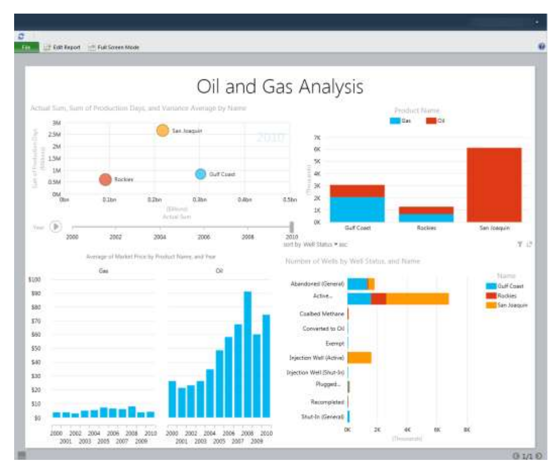
Figure 1 – Power View report displaying a variety of easily created charts

Reports in Power View are created in an environment that is familiar and easy to use. It is an interactive web-based application launched from SharePoint Server 2010, and it uses the familiar Microsoft Office ribbon. There is no guesswork or switching between design and preview mode because the user always sees formatted data exactly as it will appear. Effects of any change made to the report are shown immediately. After a report is completed it can be saved, secured, and shared in SharePoint, exported to an interactive version of the report in PowerPoint, or printed.